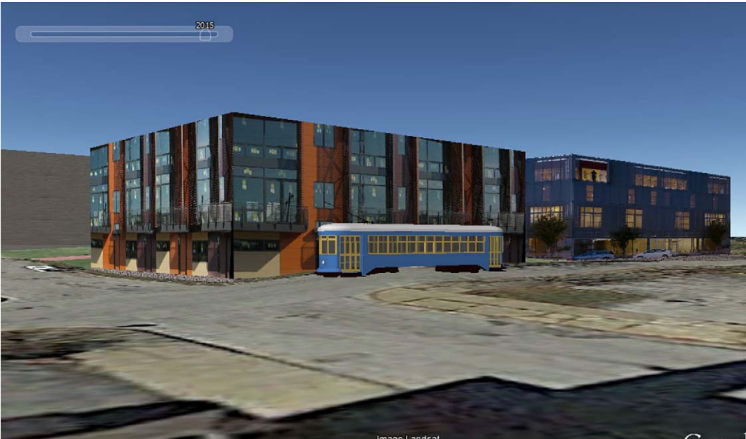
Virtual City Loft-Style Redevelopment Alternative.

a slightly different twist. After making their rounds, visitors were invited to enjoy a free bowl of ice cream and a Virtual City presentation at the Restoration Group headquarters. For a three-hour period in the afternoon, groups of two-to-five people sat for a ten-minute demonstration of the software, led by the student intern who had worked closely with the Real Estate Committee in building the 3D model. With the Google Earth display of the four-block landscape projected on a wall, the intern piloted viewers through time, noting the intensification of structures—alley houses, stables, sheds, and outhouses—over the nineteenth and early twentieth centuries, along with the diversity of land uses, which included factories, lumber yards, residential homes, and shops. The guided animation followed the depiction of mid-twentieth-century evisceration with views of the revitalized commercial district and then a series of alternative futures, one embodying the strategy of combining spot rehab with replica housing, a second featuring small, detached, affordable homes, and a third depicting a modern high-density apartment building with sleek, glass walls.