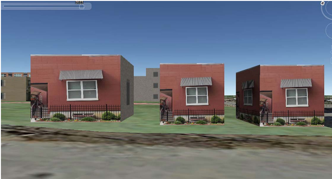
Virtual City Low-Income Redevelopment Alternative.

scale of indigenous architectural forms, deviated from the formula of replicating lost structures. Sacrificing architectural tradition for affordability, the Restoration Group asserted the primacy of two planning goals: recovery of population density and maintenance of socioeconomic diversity. The Restoration Group was especially pleased to see the new units fulfilling its vision of transitioning local renters to homeowners. 32 At the same time, leadership within the organization observed growing disenchantment with the traditional architectural styles on the part of another group seen as vital to maintaining social diversity, younger members of the creative class. Thus, in addition to a proposed redevelopment scheme that featured replica housing and the rehabilitation of salvageable stock, the revised Virtual City model offered more affordable, LEED (Leadership in Energy and Environmental Design)-certified housing as a second option and modernistic high-density apartments as a third.