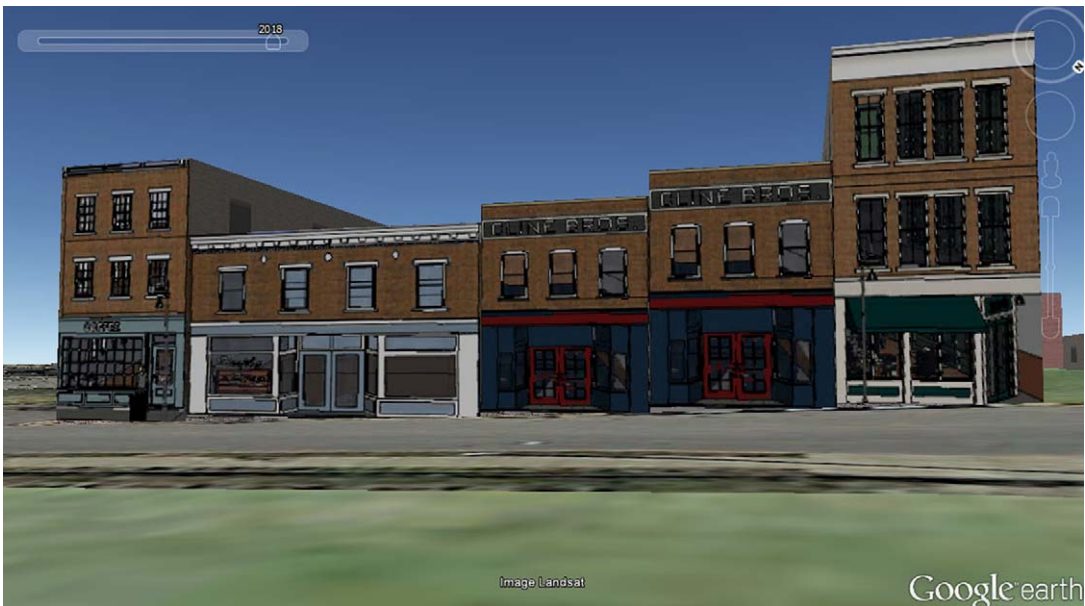
Virtual City Traditional Mixed-Use Redevelopment Scheme.