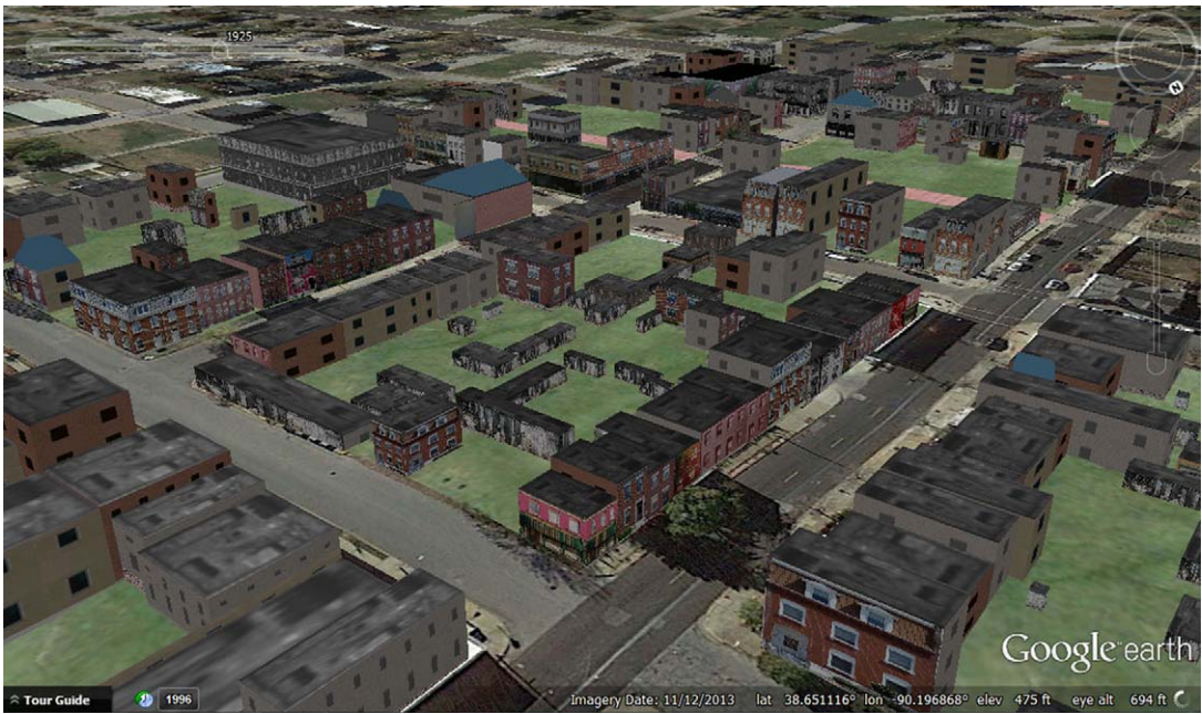
Virtual City Model of Old North St. Louis, Period of Peak Development, 1925.